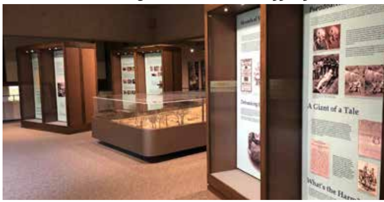
New Exhibits at Grave Creek Mound, Moundsville