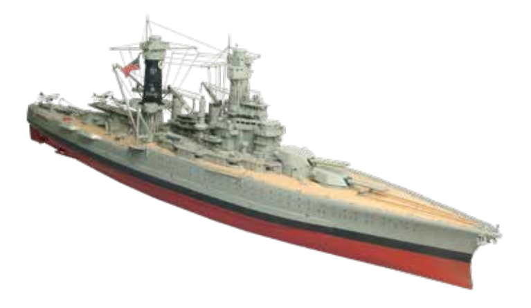
USS West Virginia BB-48 Battleship model on display in Discovery Room 20 of the museum

Incidentally some of the full-size ships are still afloat. The frigate USS Constitution is a commissioned unit of the United States Navy and is berthed in Boston Harbor. The US Brig Niagara is in Erie, Pennsylvania where she sails on Lake Erie. She is owned and maintained by the city of Erie, Pennsylvania. HMS Victory is in a dry dock in Southampton, England. A reproduction of the galleon Golden Hind sails the seven seas. The double topsail barque Charles W. Morgan has been fully restored and went on her 38th voyage in 2014, but hunted no whales. The nuclear-powered, guided missile submarine USS West Virginia (SSBN-736) is on secret, peace-keeping duty somewhere at sea protecting American interests.