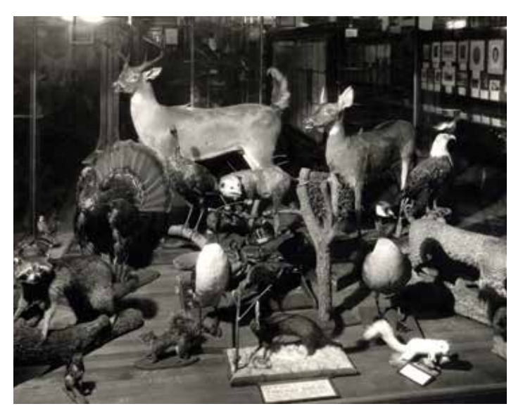
Natural history exhibit in the Capitol Annex

On the cover is a picture of the company store. One of the most popular exhibits in the new museum. The company store contained everything for the family. Owned by the company as were the employee houses, they often became the community center. Companies paid with scrip which was used in the stores. Please visit the company store in the museum.