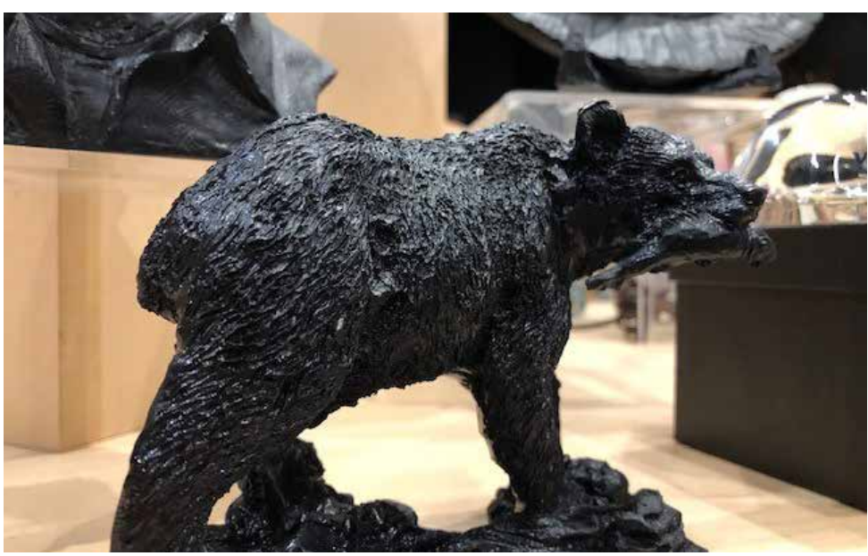
Coal figurines for sale in the museum gift shop.