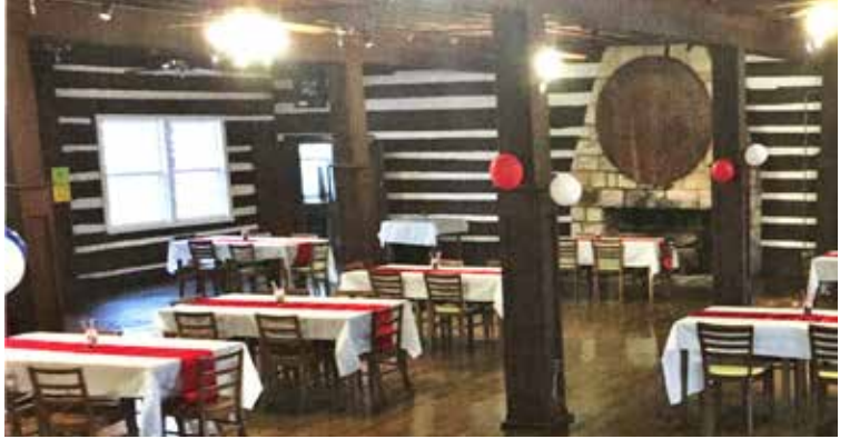
Graduatíon Party at Camp Washíngton Carver, Clífftop