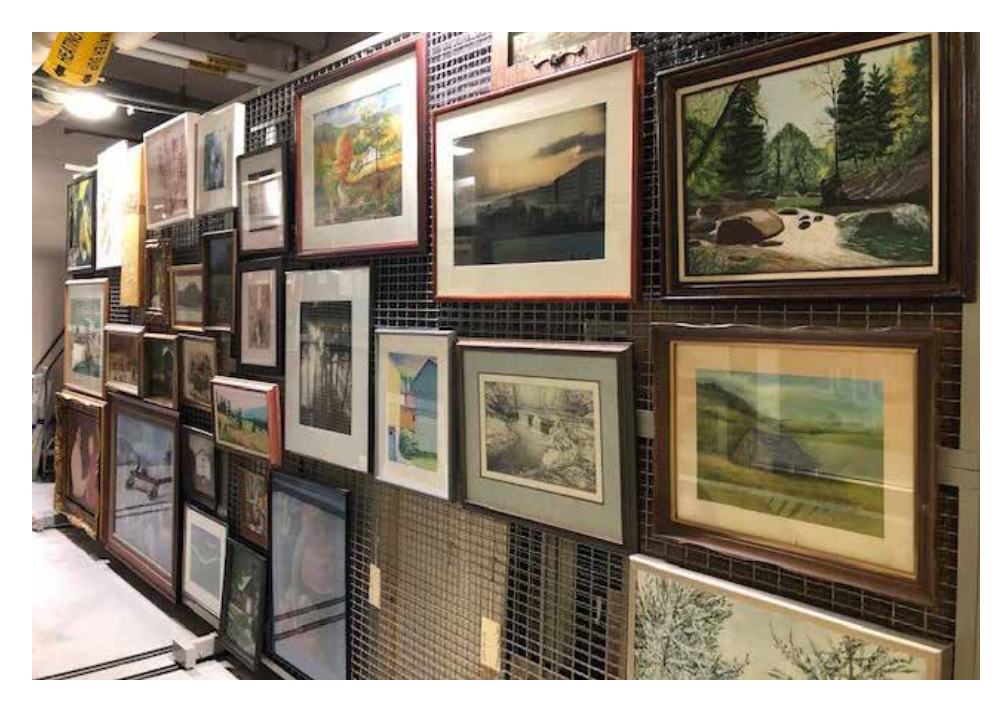
New Art Racks