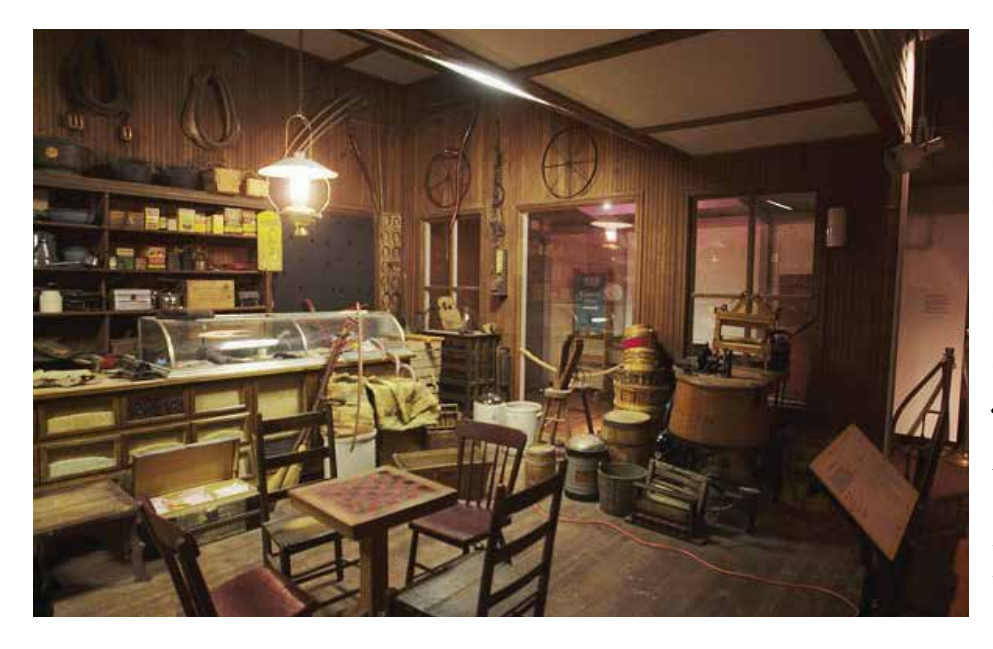
The General Store exhibit opened in the State Culture Center and the West Virginia State Museum on July 11, 1976.

In April 1969 after only three months as governor, Arch A. Moore Jr. listened to the concerns of museum staff and particularly Norman L. Fagan, the first commissioner of the new Science and Culture Center. The state needed a showcase facility that would become the welcome center of the state and a treasure that could make the citizens of the Mountain State proud. It became the top priority of the new governor. Fagan stated, "Much of our artistic beauty is our very life itself. This is what we'll strive to capture in the (Culture) Center."