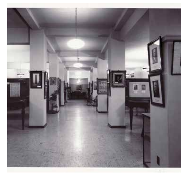
The Museum in the basement of the capitol.

The museum has become what all envisioned throughout the years. Visited by people from every state