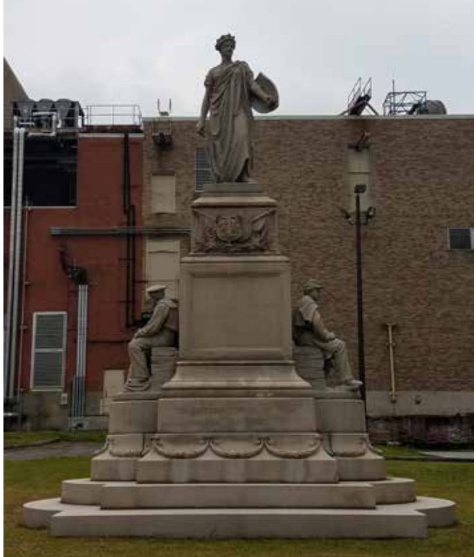
Soldiers and Sailors Monument Independence Hall, Wheeling